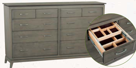
Jewelry tray detail.