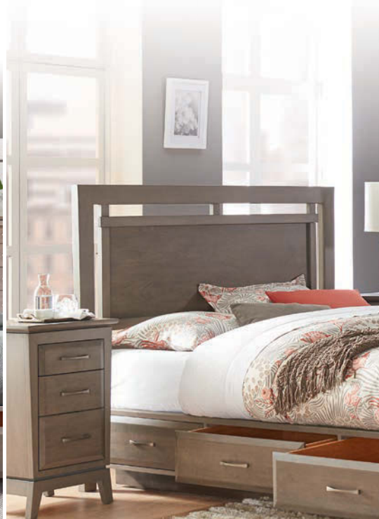
2218AST Queen Panel Storage Bed and 2116AST 3-Drawer Nightstand.