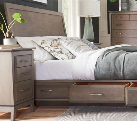
2235AST Queen Adjustable Storage Bed, 2115AST Small 3-Drawer Nightstand and 2143AST 6-Drawer Chest.