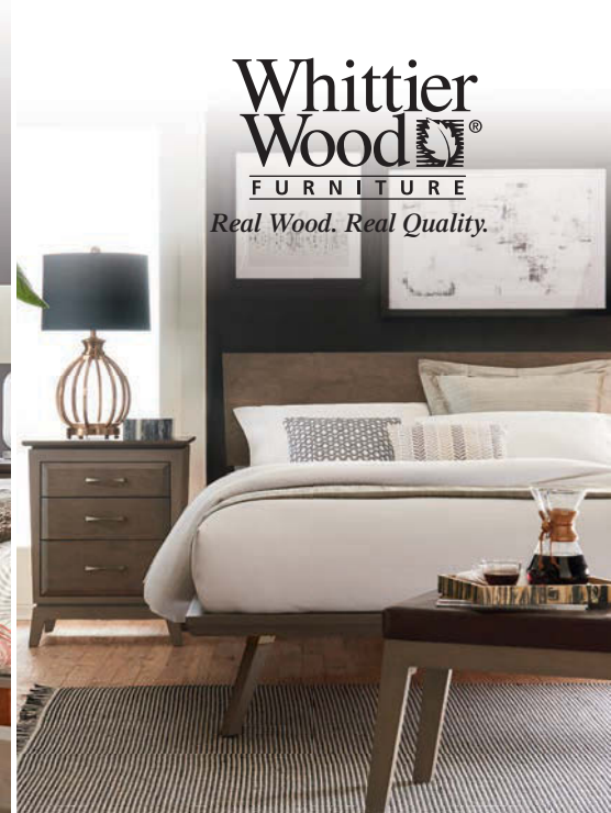
3910AST Queen Alder Adjustable Headboard Platform Bed, 2116AST 3-Drawer Nightstand and 2140AST Upholstered Bench.